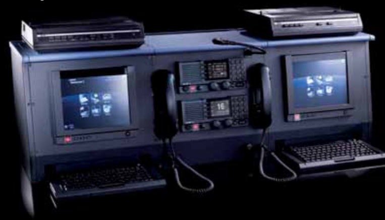
SAILOR® 6000 Consoles