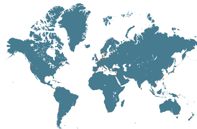
● = On Board Service Centers

At Thrane & Thrane, we have a reputation for making products that do not fail. However, we also realize that you need access to timely support around the clock for essential repairs and maintenance.