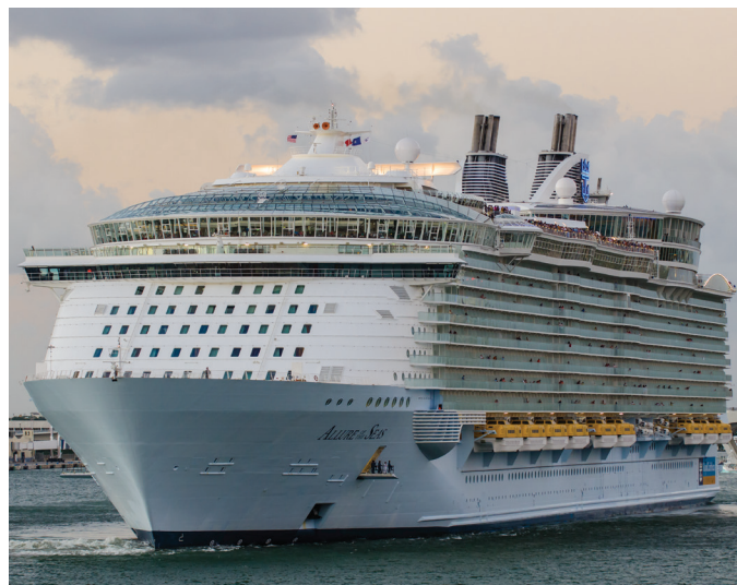
The Royal Caribbean cruise ship, the Allure of the Seas, equipped with a NAVIPILOT 4000